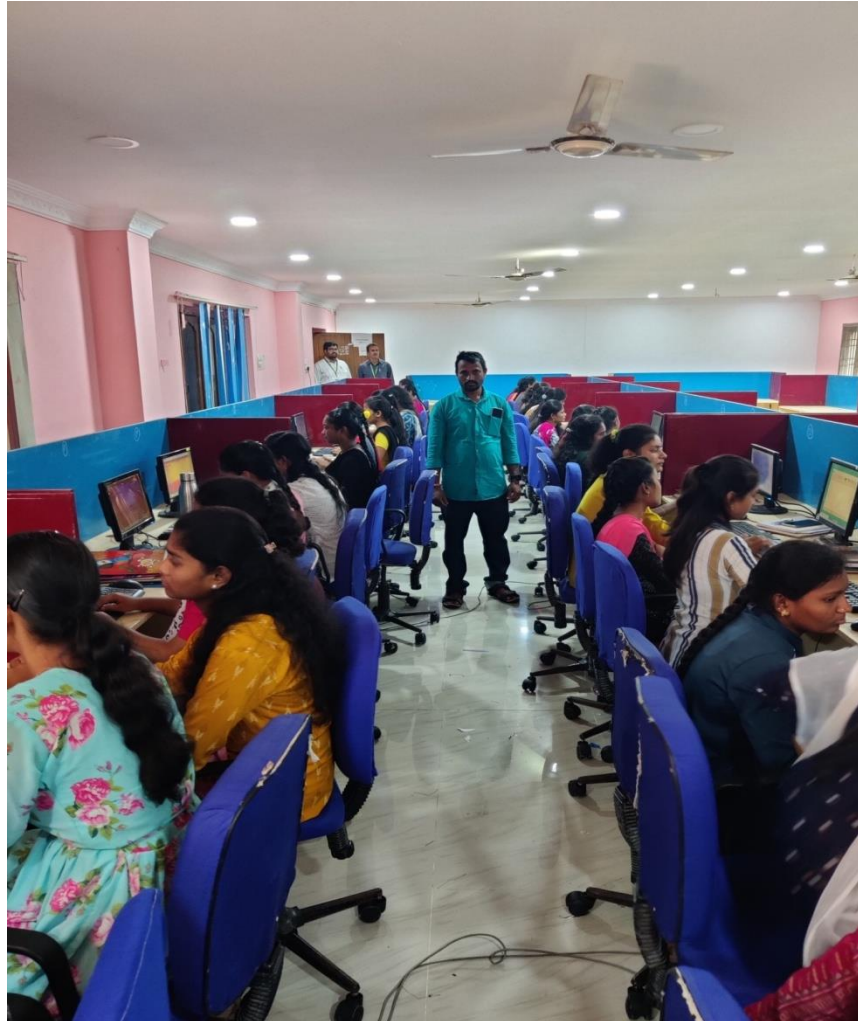
Programme conducted on 07-09-2023 to 09-09-2023